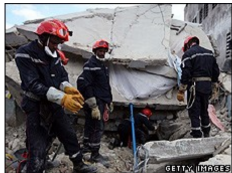
Many rescuers such as these from France are doing their part to help return Haiti back to normal.

Music artists are not to be left out. There is also word of a benefit concert to be organized soon with names such as Bono and Justin Timberlake already on the line up. With the celebrities taking action, the activists heading down to the city itself, one must wonder what they can do. Well the answer is simple; most companies have links for easy donations. To help the heart-wrenched Haitians, just go to a website and do your part.